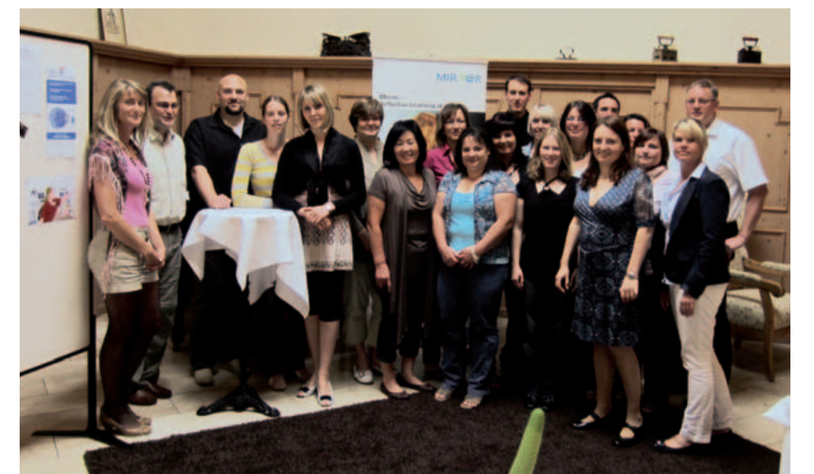
»Employees Stroke Unit«

Certifications and law restrictions make necessary documented process's using »DFKI-process-app«